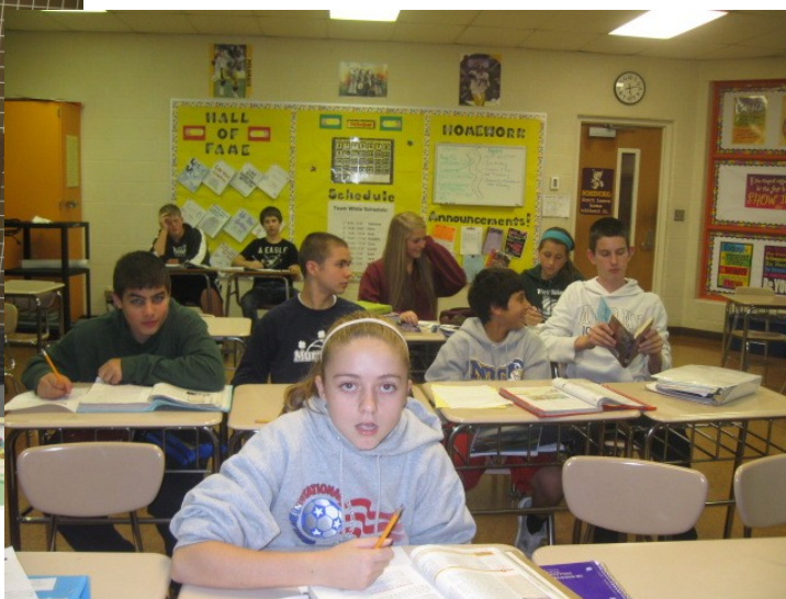
Having fun in math!